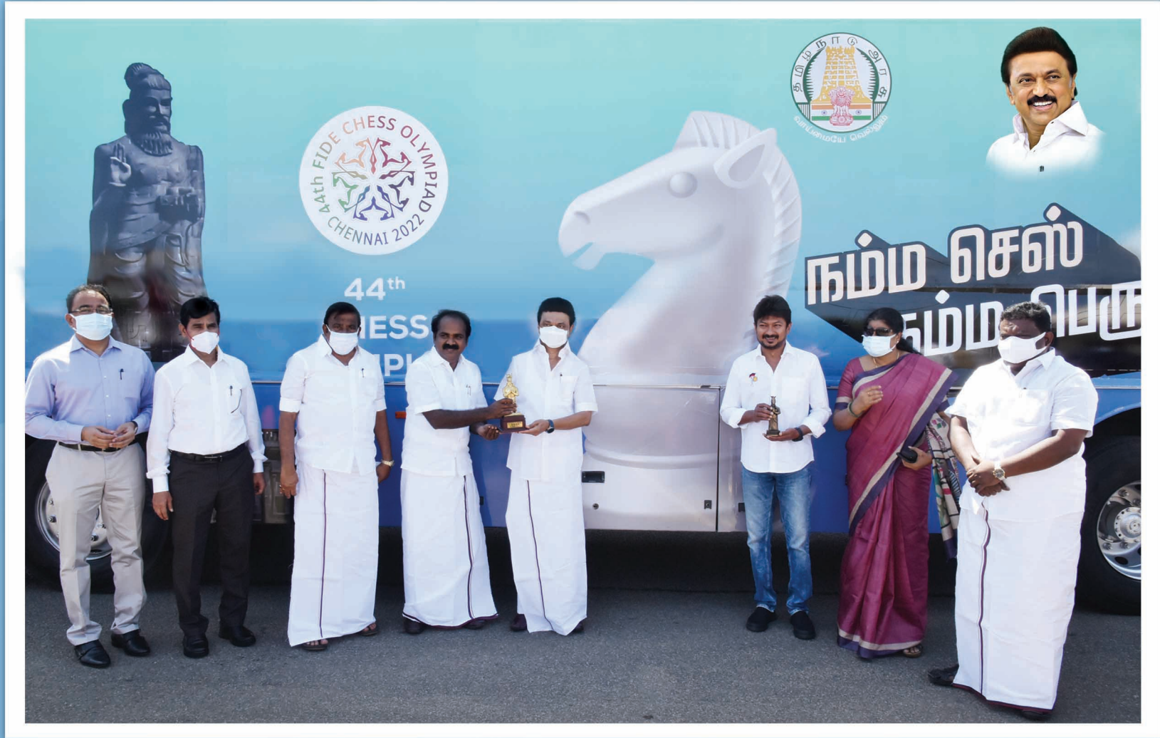
Hon'ble Chief Minister of Tamil Nadu Thiru. M. K. Stalin flagged off 15 buses sporting the logo, symbol and tag-lines of the 44 th Chess Olympiad-2022 competition, to advertise the event and create awareness about it, at Kamarajar Salai, Chennai on 01.07.2022.