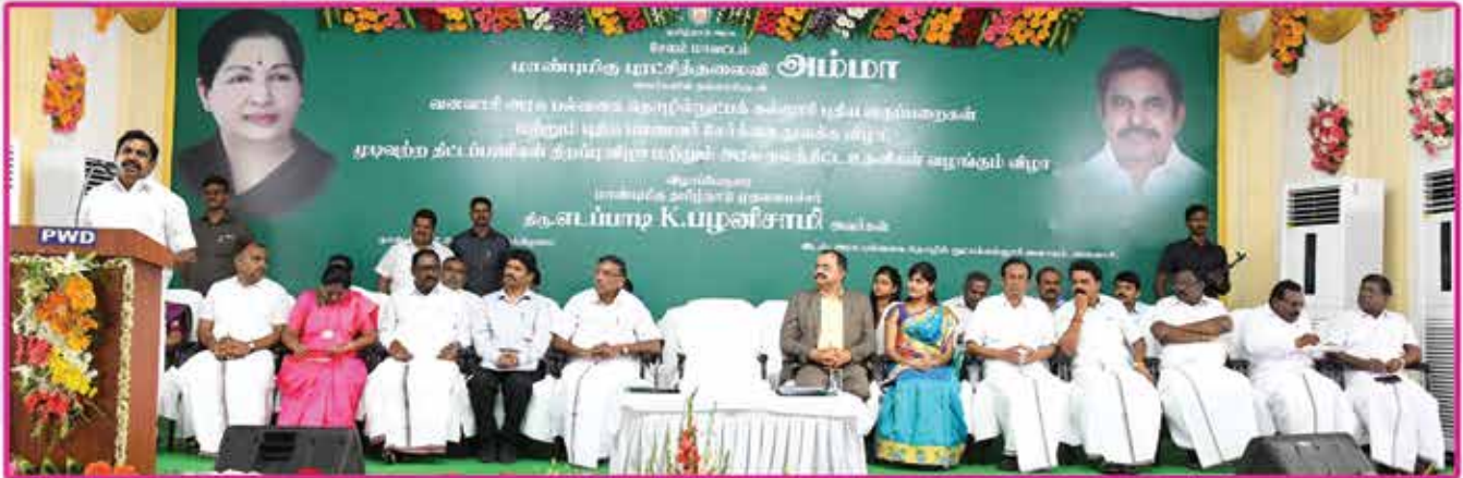
Speech of the Hon'ble Chief Minister of Tamil Nadu Thiru. Edappadi K. Palaniswami at a function at Vanavasi in Salem District on 27.07.2018 ( English Translation ).

B owing to goddess Hon'ble Idaya Deivam Puratchi Thalaivi Amma,