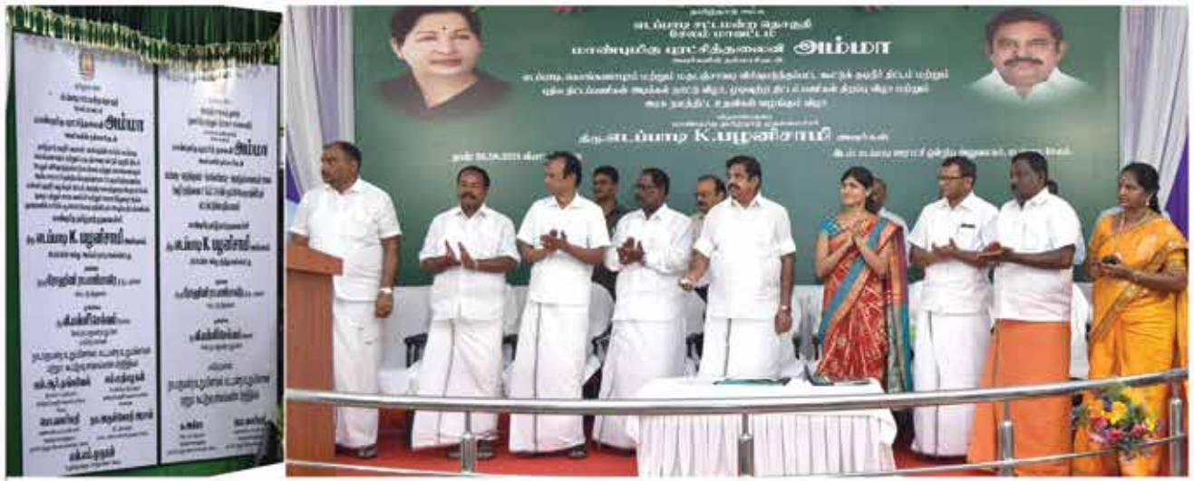
Speech of the Hon’ble Chief Minister of Tamil Nadu Thiru. Edappadi K. Palaniswami at a Government function at Edappadi, Salem District on 30.08.2018 ( English Translation ).

P aying obeisance to Goddess Hon’ble Idaya Deivam Puratchi Thalaivi Amma,