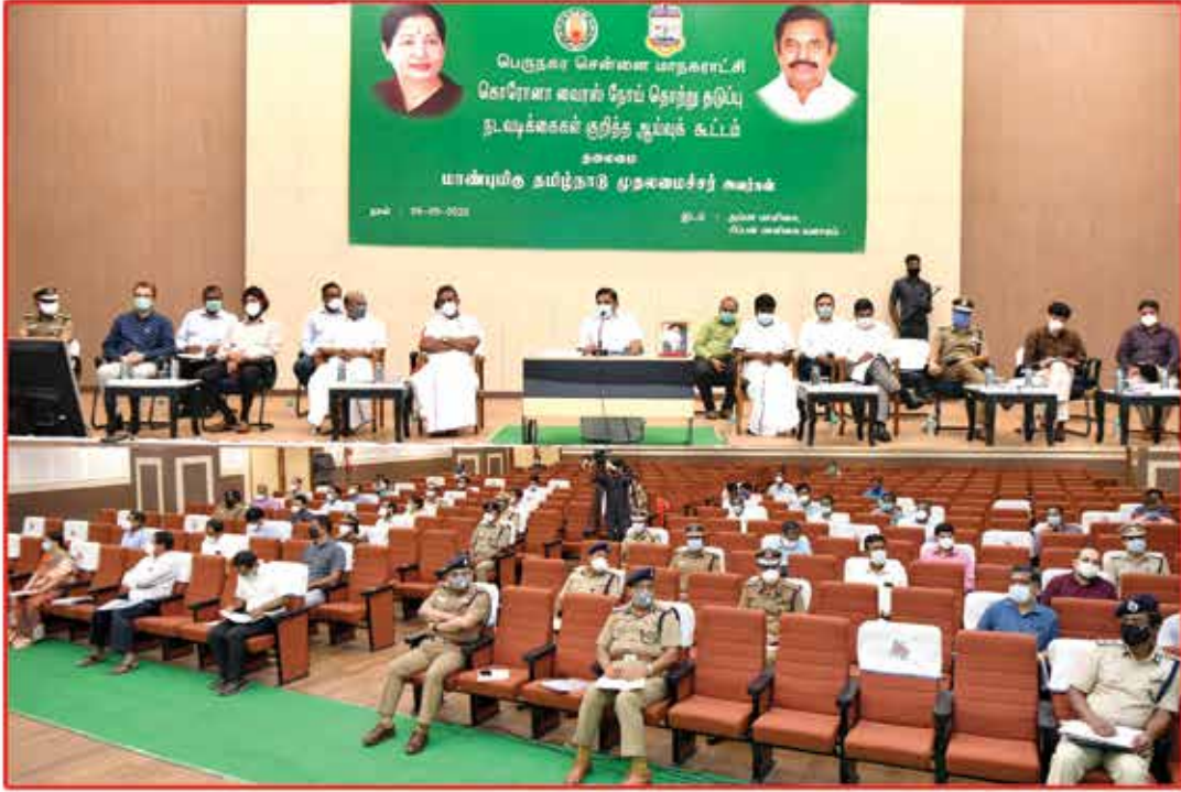
Speech of Hon' ble Chief Minister of Tamil Nadu Thiru. Edappadi K. Palaniswami at Amma Maligai on 05.05.2020 in the Greater Chennai Corporation office complex, after a review meeting regarding Corona Virus infection preventive actions in Chennai city ( English Translation ).

M y humble respects to all the members of the general public.