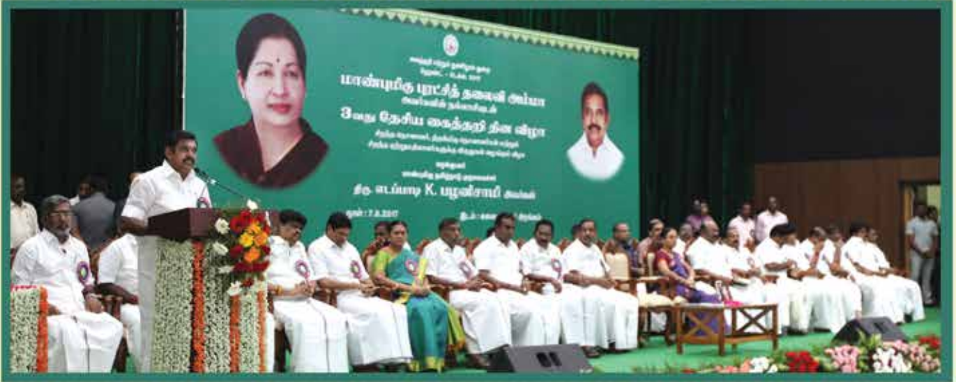
Speech of the Hon'ble Chief Minister of Tamil Nadu Thiru. Edappadi K. Palaniswami at the Third National Handloom Day function on 07.08.2017 ( English Translation ).

I offer my respects to Idaya Deivam Puratchi Thalaivi Amma.