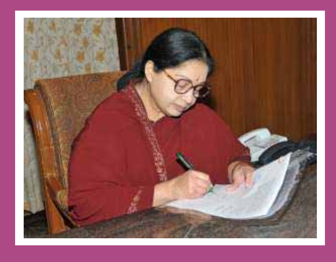
Issue immediate directions to the Department of Fertilizers to allocate the full requirement of fertilizers for Tamil Nadu

"It is with a sense of deep pain and anguish that I write this letter to you to protect the interests of the farmers of Tamil Nadu. The introduction of the Nutrient Based Subsidy Scheme (NBS) by the Government of India from 1<sup>st</sup> April, 2010, coupled with an unreliable supply of fertilizers to the State is indeed threatening to deprive our farmers of their basic means of sustenance and livelihood.