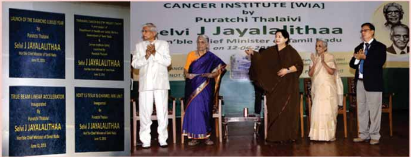
Speech delivered by Selvi J Jayalalithaa, Hon'ble Chief Minister of Tamil Nadu at the Launch of the Diamond Jubilee Year of the Cancer Institute, Chennai on 12.6.2013.

It is with great pleasure, that I take part in this landmark event, that rededicates the services of this colossal institution, in its ardent and assiduous mission to save people from the claws of the killer disease- Cancer. In the words of Sir William Osler, “Medicine is an art, not a trade; a calling, not a business; a calling in which your heart will be exercised equally with your head”. The Cancer Institute has verily given life to this mission, it has indeed lived its mission in its 60 years of existence.