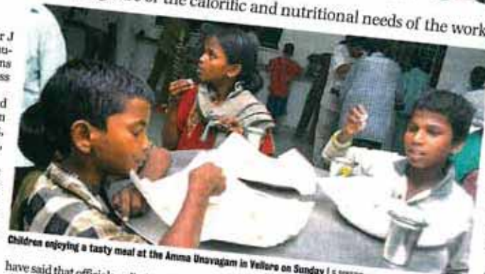
Children enjoying a tasty meal at the Amma Unavagam in Vellore on Sunday

have said that officials pulled all stops to handle the civil works and other logistical challenges to implement Chief Minister's announce-