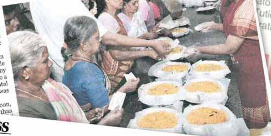
Amma Unavagams' in other cities. A scene at an

Of the nine cities, Tuticorin witnessed the maximum sale of 15,990 idlis followed by Vellore 14,809, according to a senior official here. The total number of idlis sold was around 1.07 lakh.