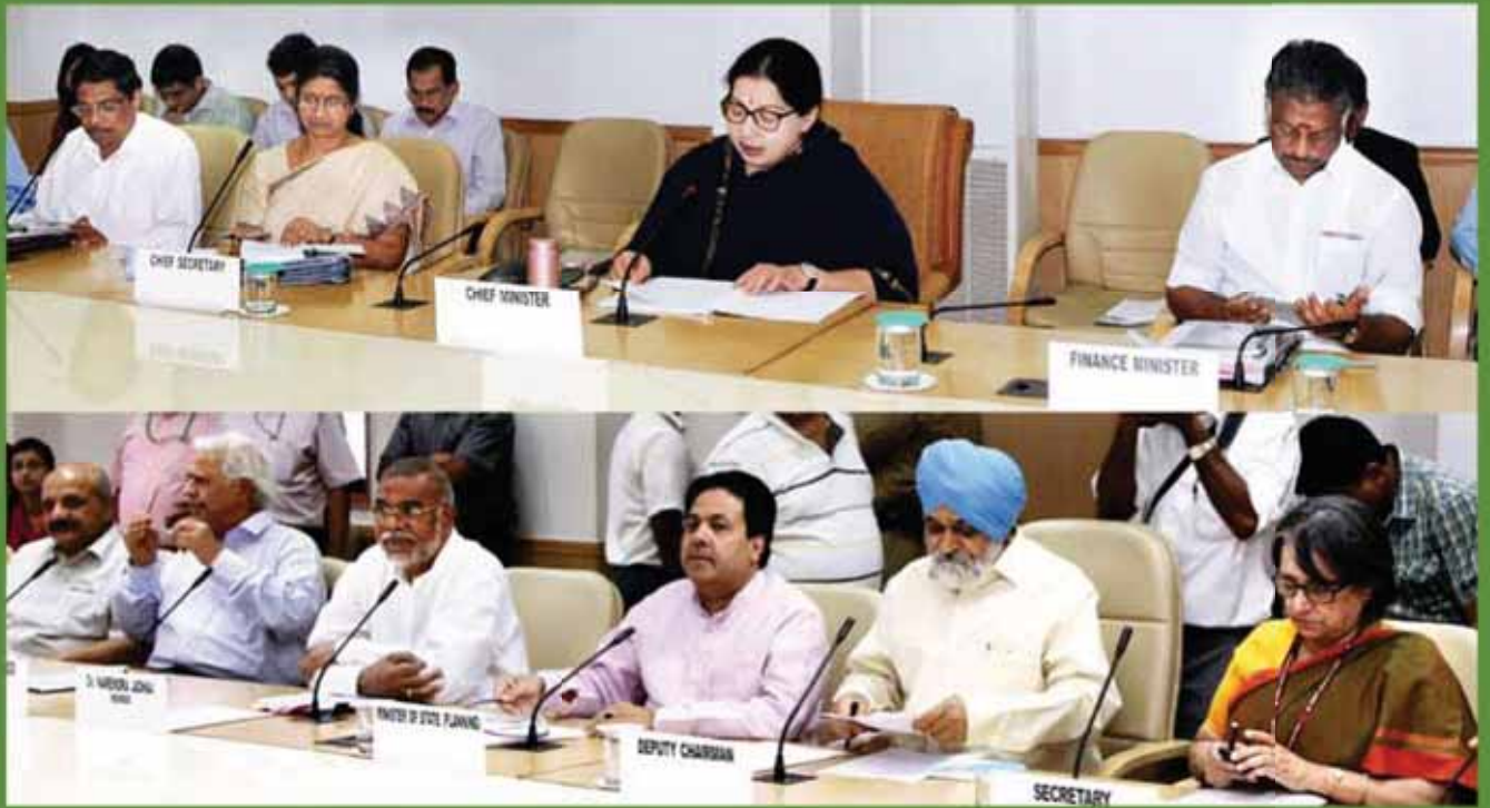
Speech delivered by Selvi J Jayalalithaa , Hon'ble Chief Minister of Tamil Nadu during the finalisation of Annual Plan for Tamil Nadu for the year 2013-2014 with the Deputy Chairman, Union Planning Commission on 10.6.2013 at New Delhi.

Hon'ble Deputy Chairman of the Union Planning Commission, Shri Montek Singh Ahluwalia,