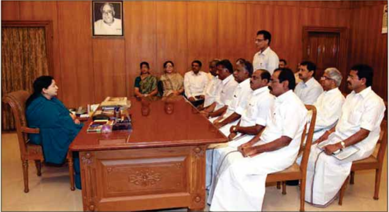
Statement of the Hon'ble Chief Minister of Tamil Nadu Selvi J Jayalalithaa on 14.6.2013 (English Translation)

Whatever be the odds, whether Nature fails or Karnataka refuses to release water, the people of Tamil Nadu know very well that my Government is meticulously working towards improving remarkably the agriculture industry and in enhancing the standard of living of farmers.