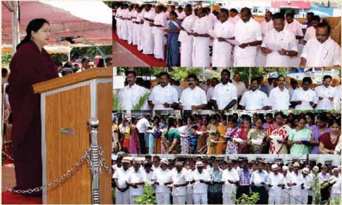
Hon'ble Chief Minister of Tamil Nadu Selvi J Jayalalithaa administered the anti-terrorism day pledge at the Secretariat on 21.5.2013 in memory of former Indian Prime Minister Rajiv Gandhi.