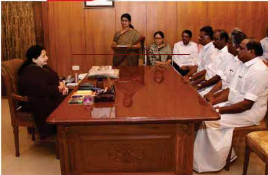
Statement of the Hon'ble Chief Minister of Tamil Nadu Selvi J Jayalalithaa on 20.6.2013

A detailed review meeting was held at the Secretariat today (20.6.2013) under my chairmanship to consider the steps to be taken to bring back Tamil Nadu pilgrims who have been stranded at Kedharnth and Badrinath in the District of Rudraprayag and Samoli in Uttarakhand State on account of heavy rains and landslides.