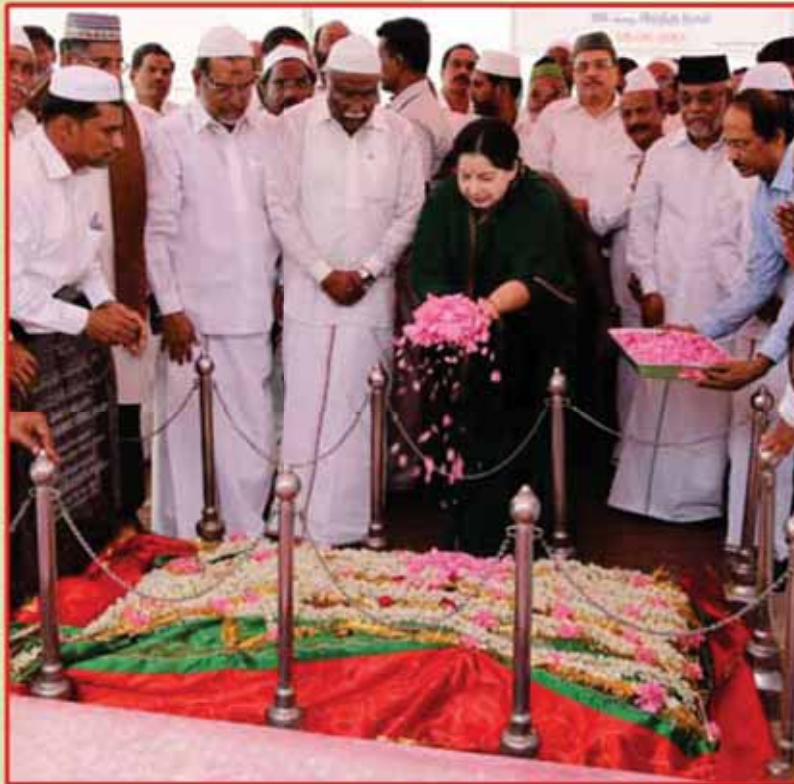
Hon'ble Chief Minister of Tamil Nadu Selvi J Jayalalithaa laid a floral spread at the memorial of Quaid-e-milleth on 5.6.2013, at the Wallajah Big Mosque in Triplicane on the occasion of his 118th birth anniversary.