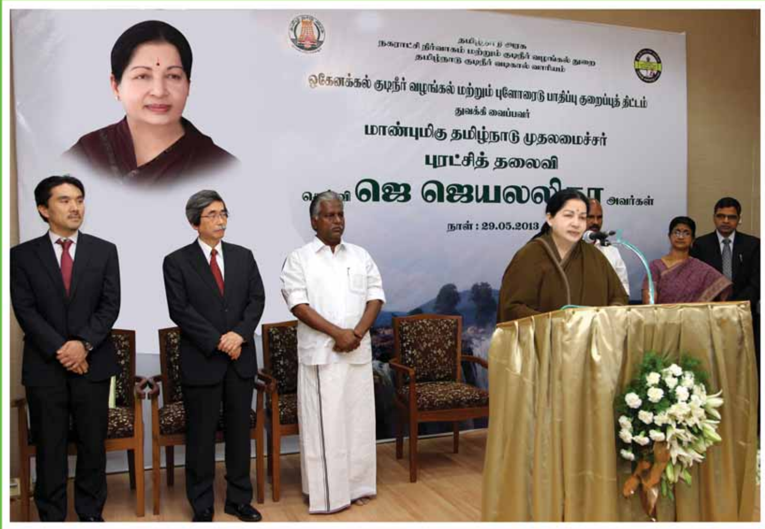
Hon'ble Chief Minister of Tamil Nadu Selvi J Jayalalithaa speaking while inaugurating the Hogenakkal Water Supply and Flouride Mitigation Scheme through video conferencing at the Secretariat on 29.5.2013.