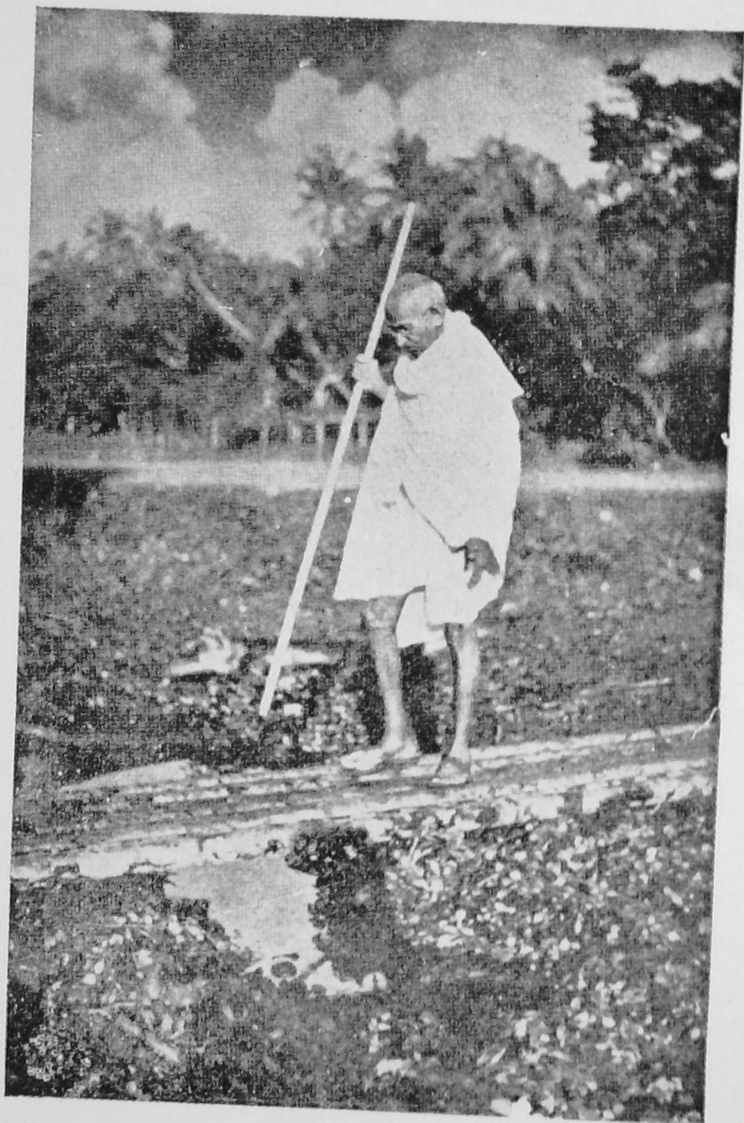
THE LONELY PILGRIM