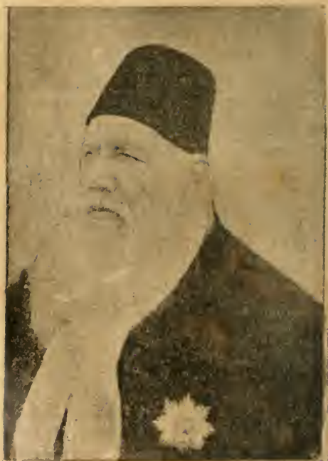
Sir Syed Ahmed Khan.