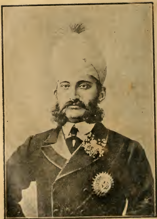
H. H. The Late Nizam of Hyderabad.