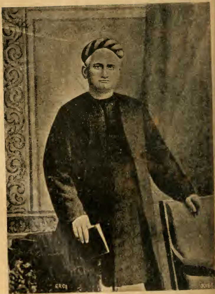
Bankim Chandra Chatterjee.