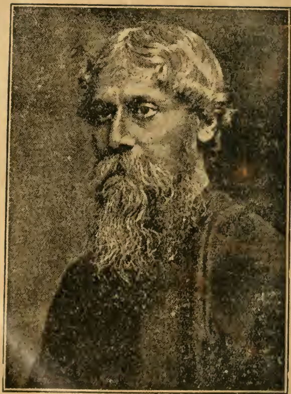
Sir Rabindranath Tagore.