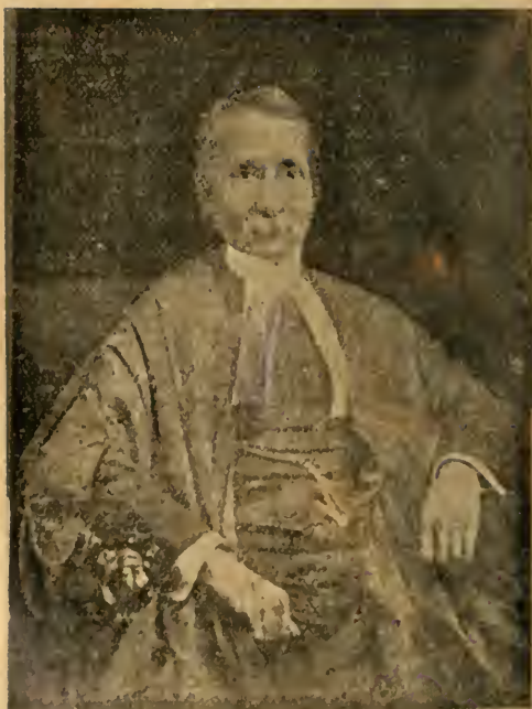
Sir Gurudas Banerjee.