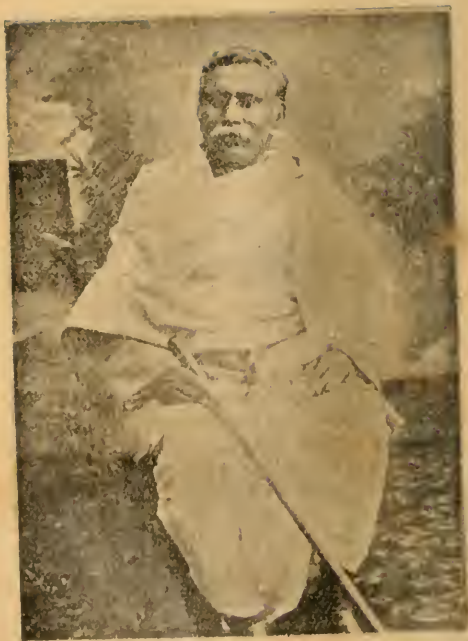
Babu Aswini Kumar Dutt.