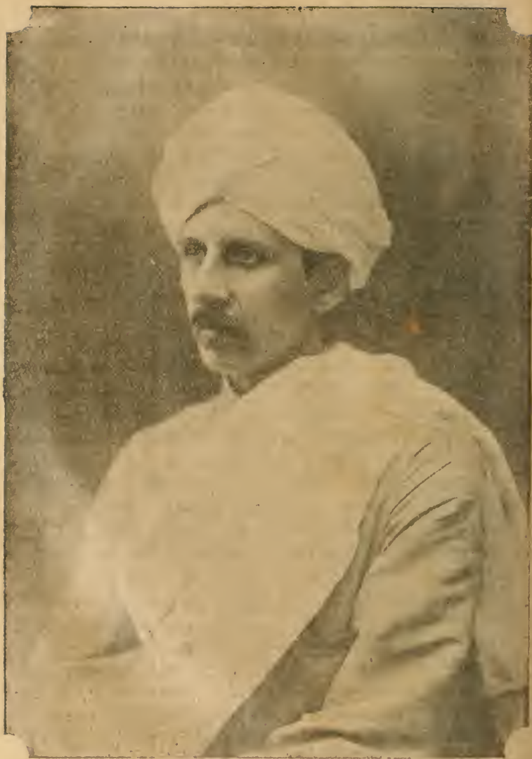
Dr. A. K. Coomaraswamy.