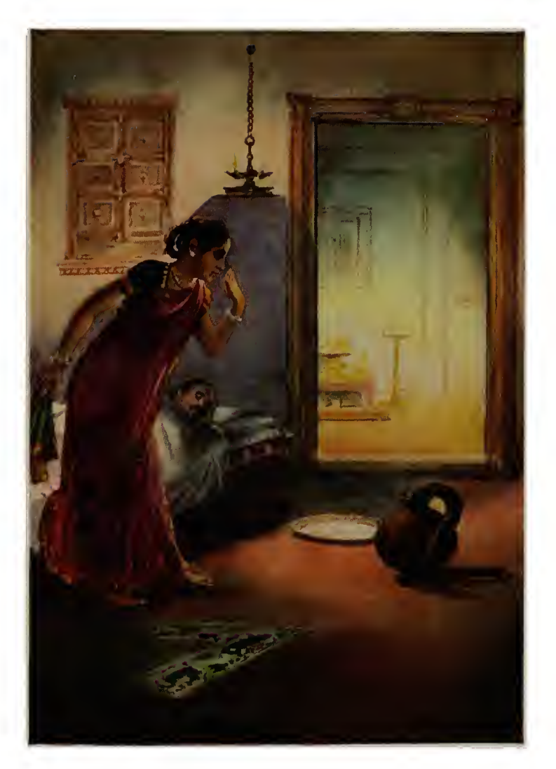
"IT CURLED ITSELF UP INSIDE THE EARTHEN JAR."