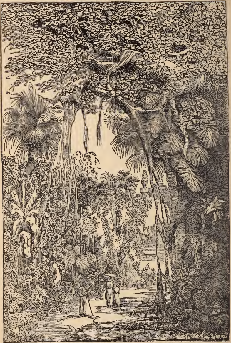
THE VALE OF DUMBERA.