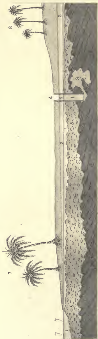
SECTION OF SEA COAST.