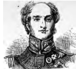
Lieut.-General Sir Edward Barnes.