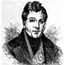
Sir Robert Wilmot Horton.