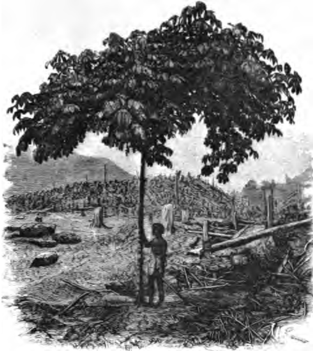
THE CEARA RUBBER TREE.

A specimen of rapid growth in Ceylon (Sembawattie Estate); 17 ft. high, 10 in. in circumference, and only nine months old.