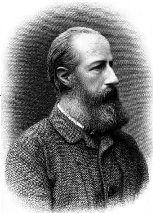
The Honourable Sir Arthur Gordon G. M. G. Governor of Ceylon.