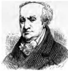
General Sir Robert Brownrigg.