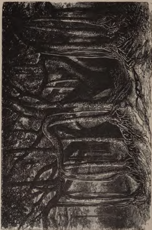
THE BANYAN TREE ( Ficus Indica ).