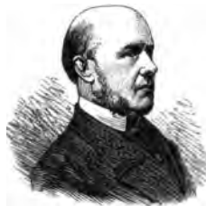
Sir Hercules G. R. Robinson.