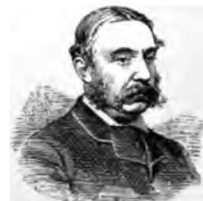
Sir John Douglas.

SOME OF THE BRITISH GOVERNORS OF CEYLON. (For complete List see Appendix IV Page 999)