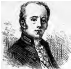
Hon. F. North, Earl of Guilford.