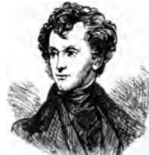
Sir James Emerson Tennent.