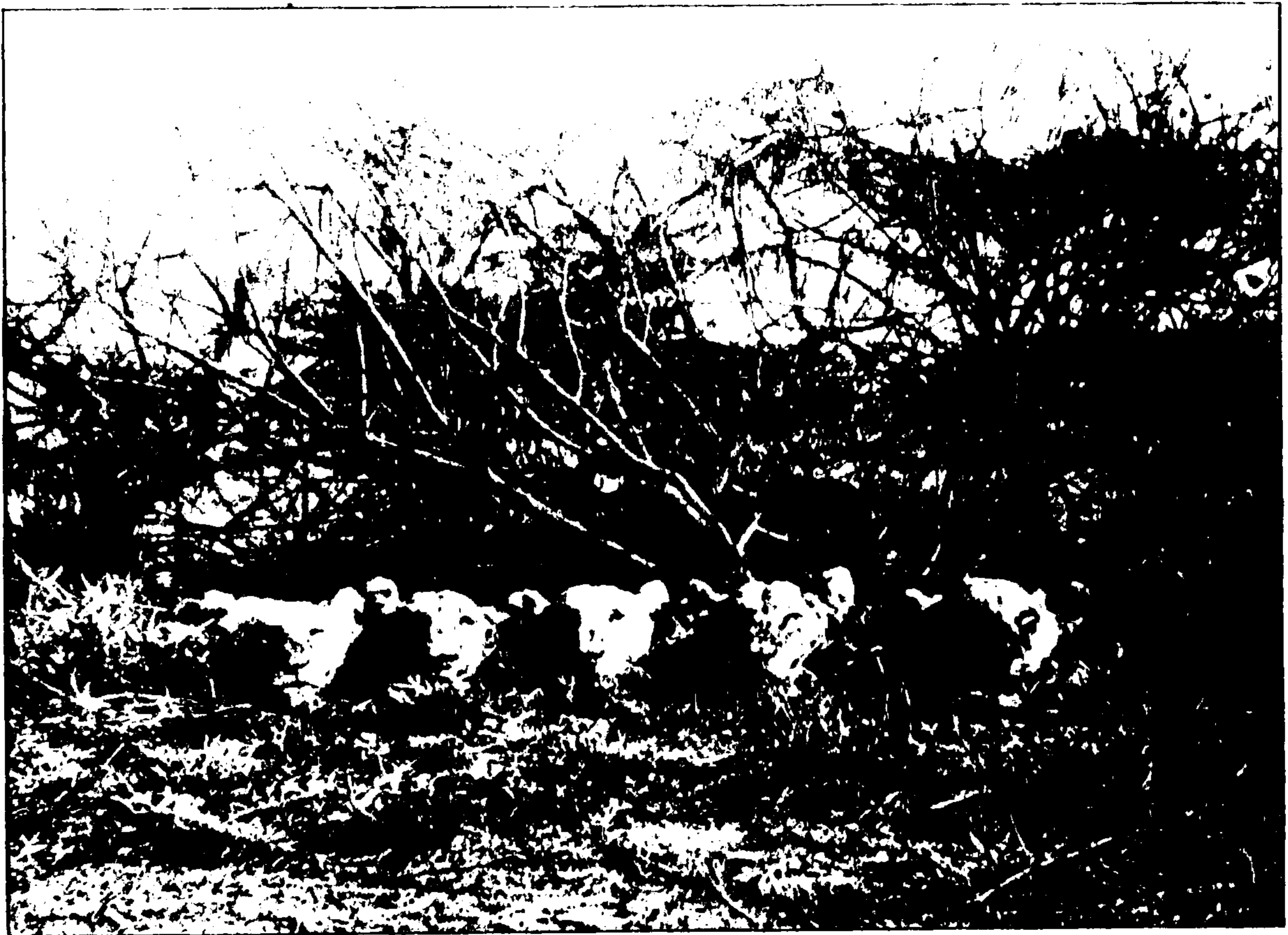
A HALF-HOUR'S BAG.