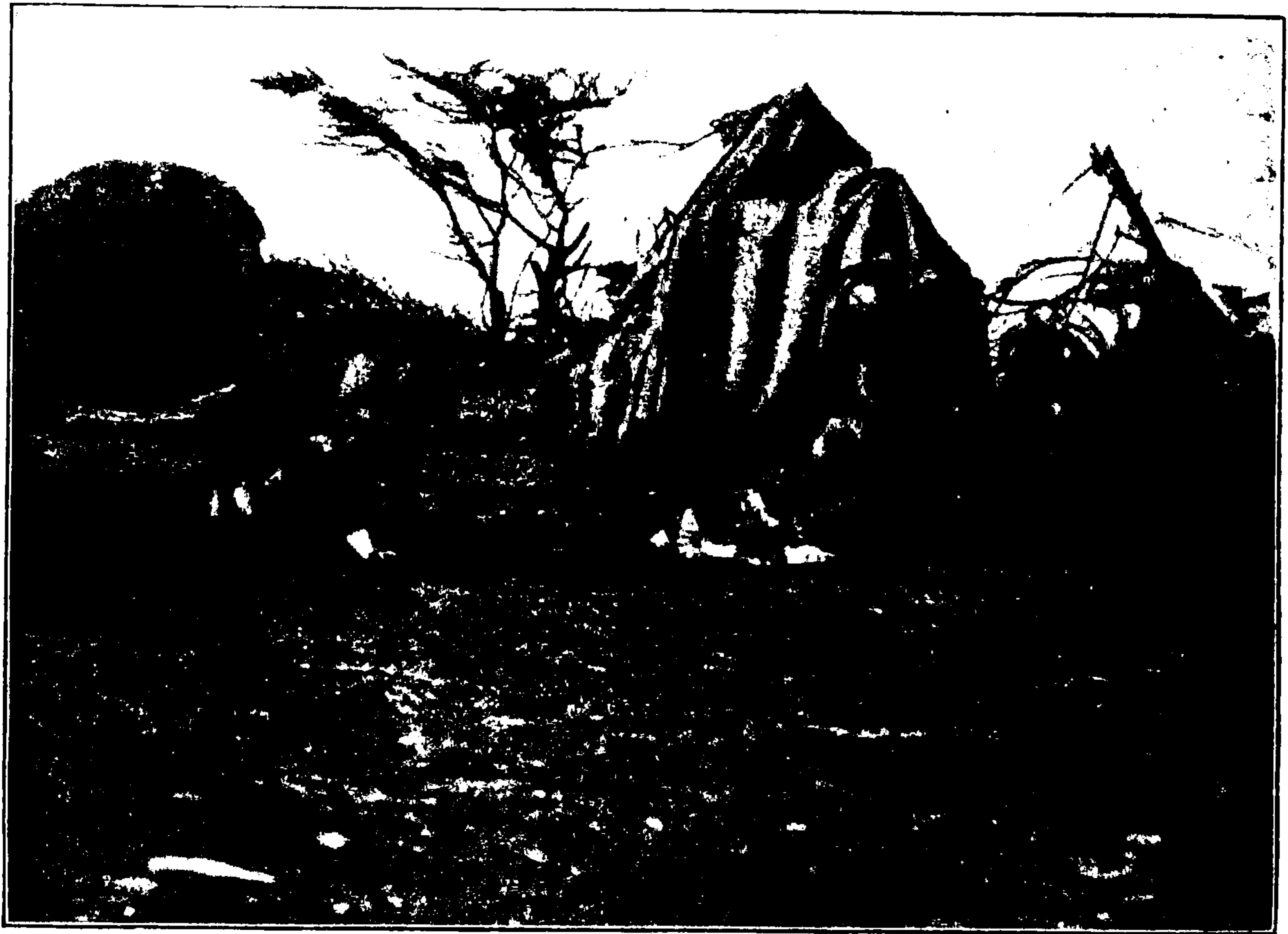
A LION ON THE PROWL.