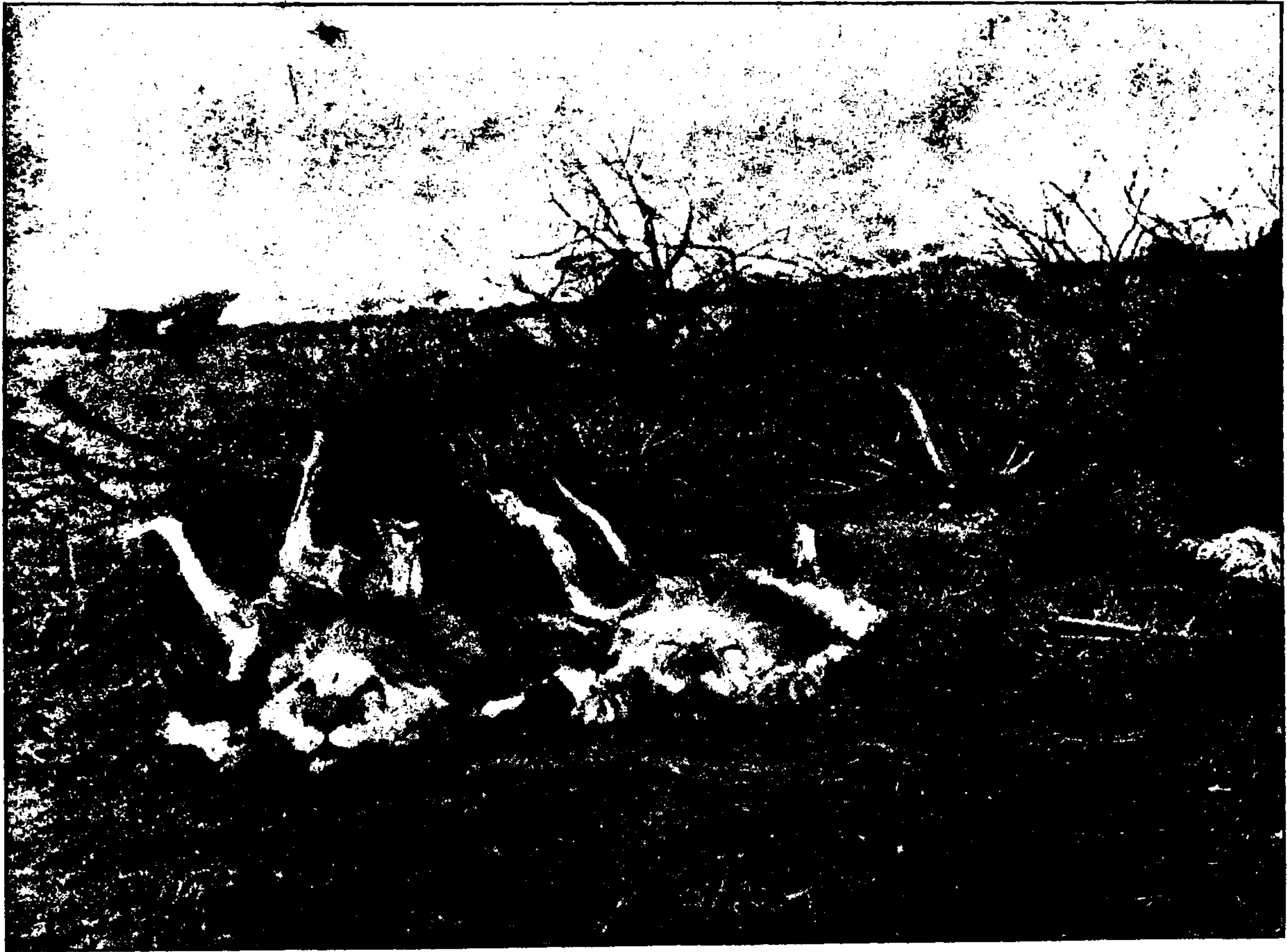
MY FIRST LIONS.