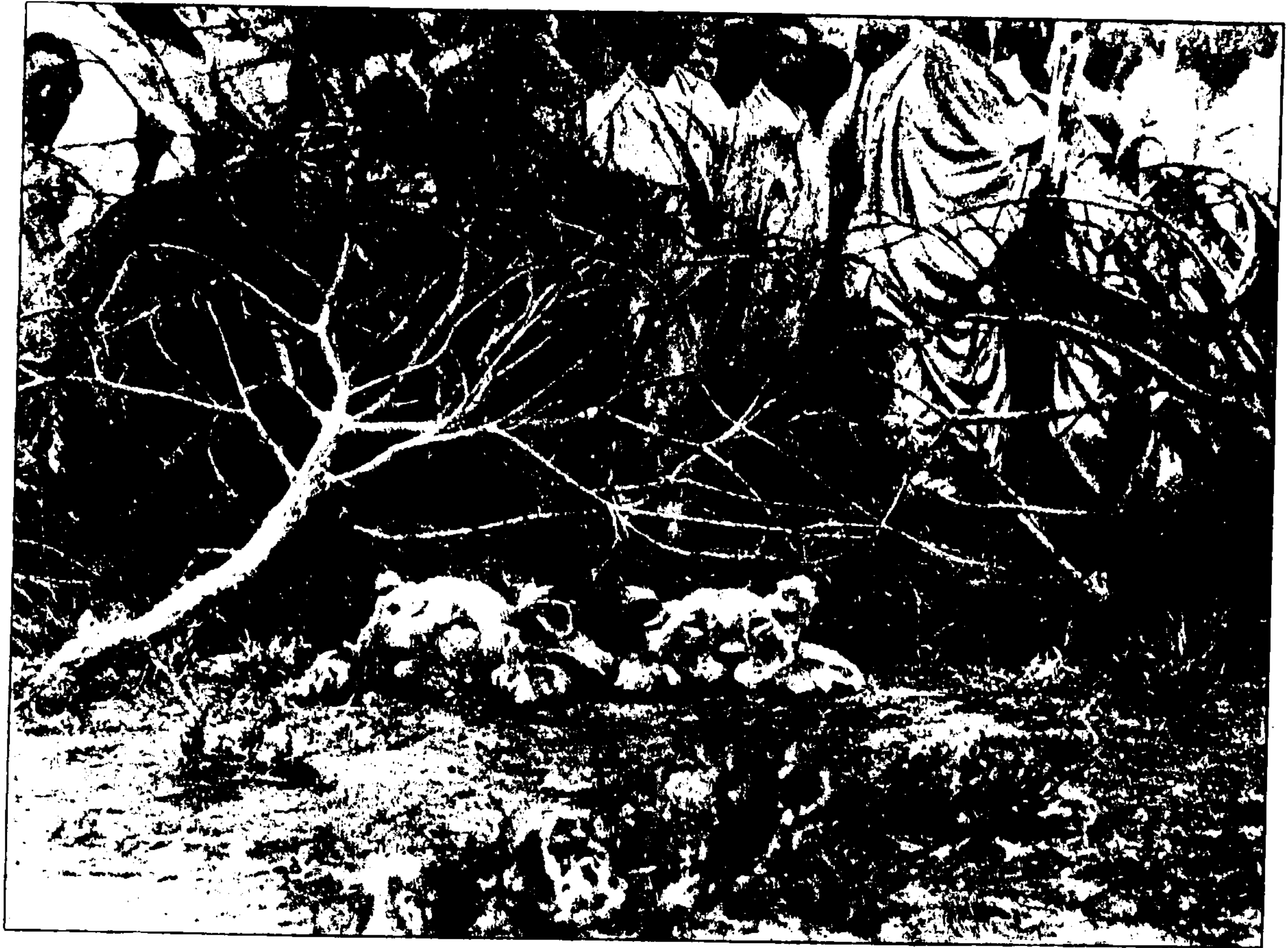
AFTER A FAREWELL DAY WITH THE LIONS.