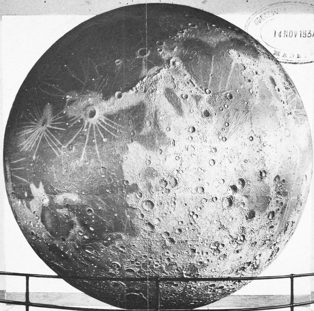
PHOTOGRAPH OF MODEL IN RELIEF OF THE VISIBLE HEMISPHERE OF THE MOON. HALL 35.