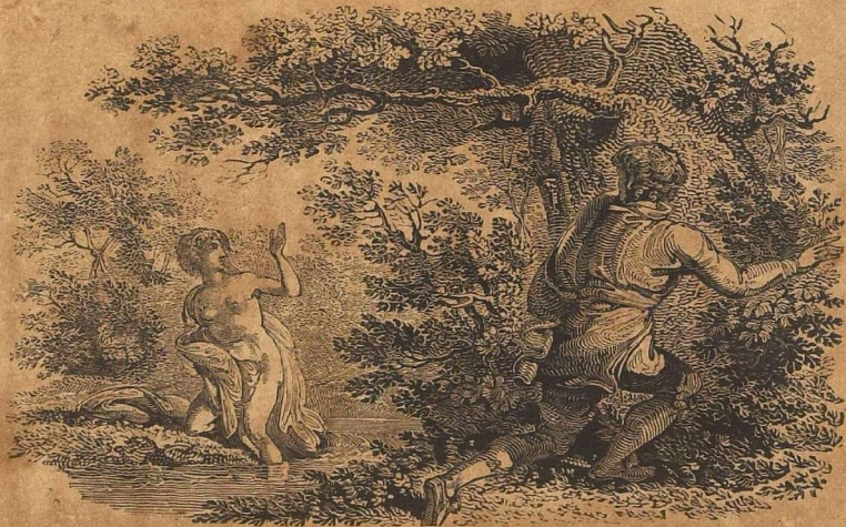
S U M M E R.