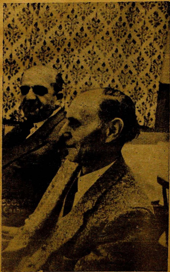
Doctors Meeting at Hotel Krononhof in West Germany.