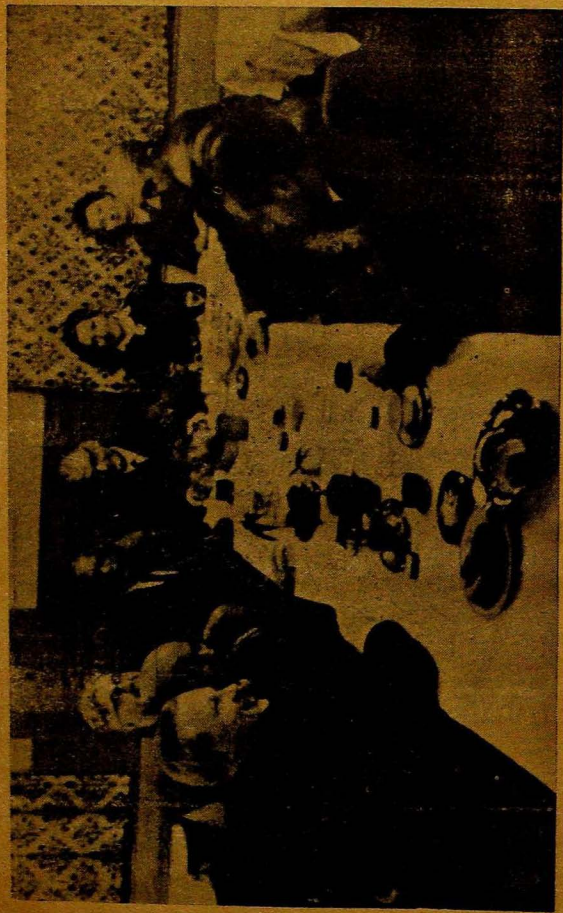
Doctors Meeting at Hotel Kronenhof in West Germany.