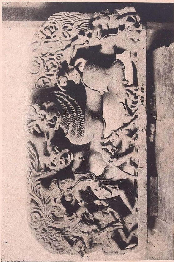
'A stone sculpture depicting the Hoysala King setting out for hunting and attacking a lion that wanted to capture his game—the wild boar who was already pierced before. The small figure on the horseback behind shows the King setting out for the chase'.