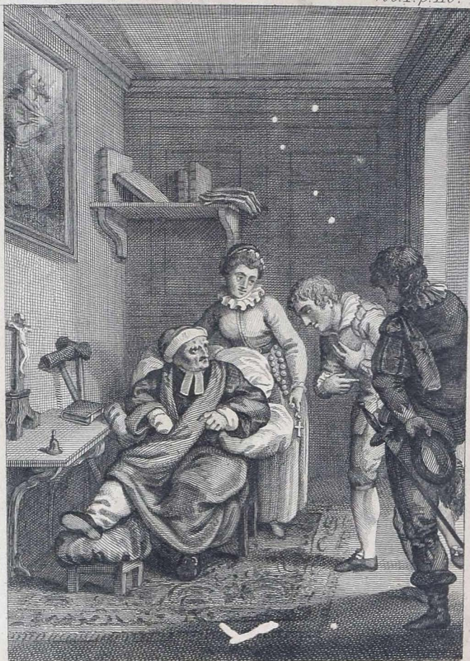
A Smith, & Co. Clements Inn, Strand