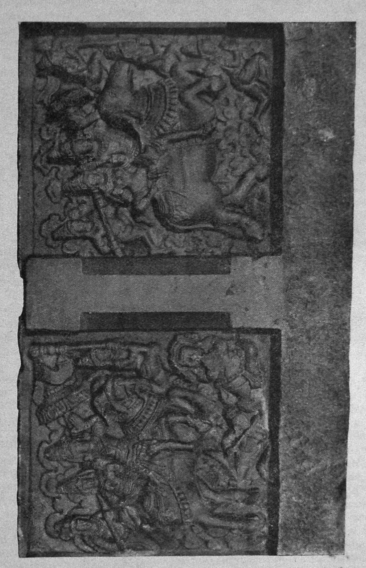
AGNI AND YAMA PANELS of ceiling slab from Hemavati,