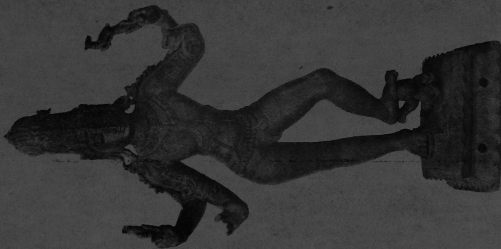
TRIPURANTAKA (BRONZE) Vallam, Thanjavur taluk, Thanjavur district