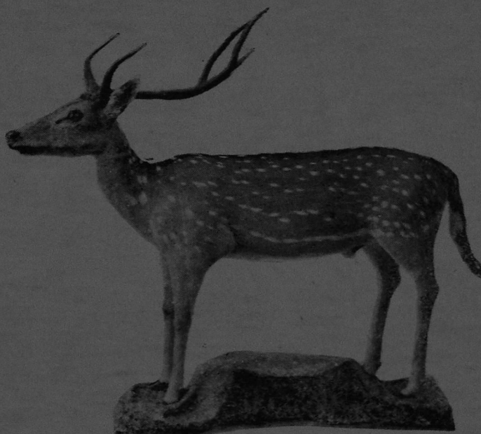
THE SPOTTED DEER ( Axis axis ).