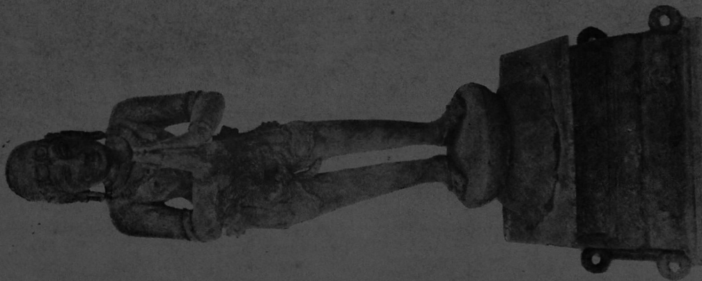
TIRUMANGAI ALVAR (BRONZE) Kalpattu, Villupuram taluk, South Arcot district