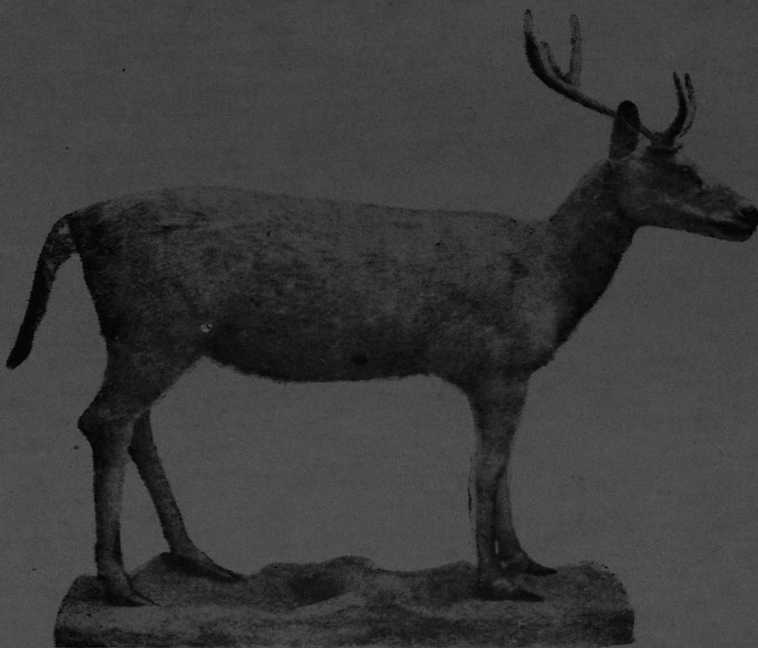
THE SAMBAR ( Rusa unicolor nigra ).